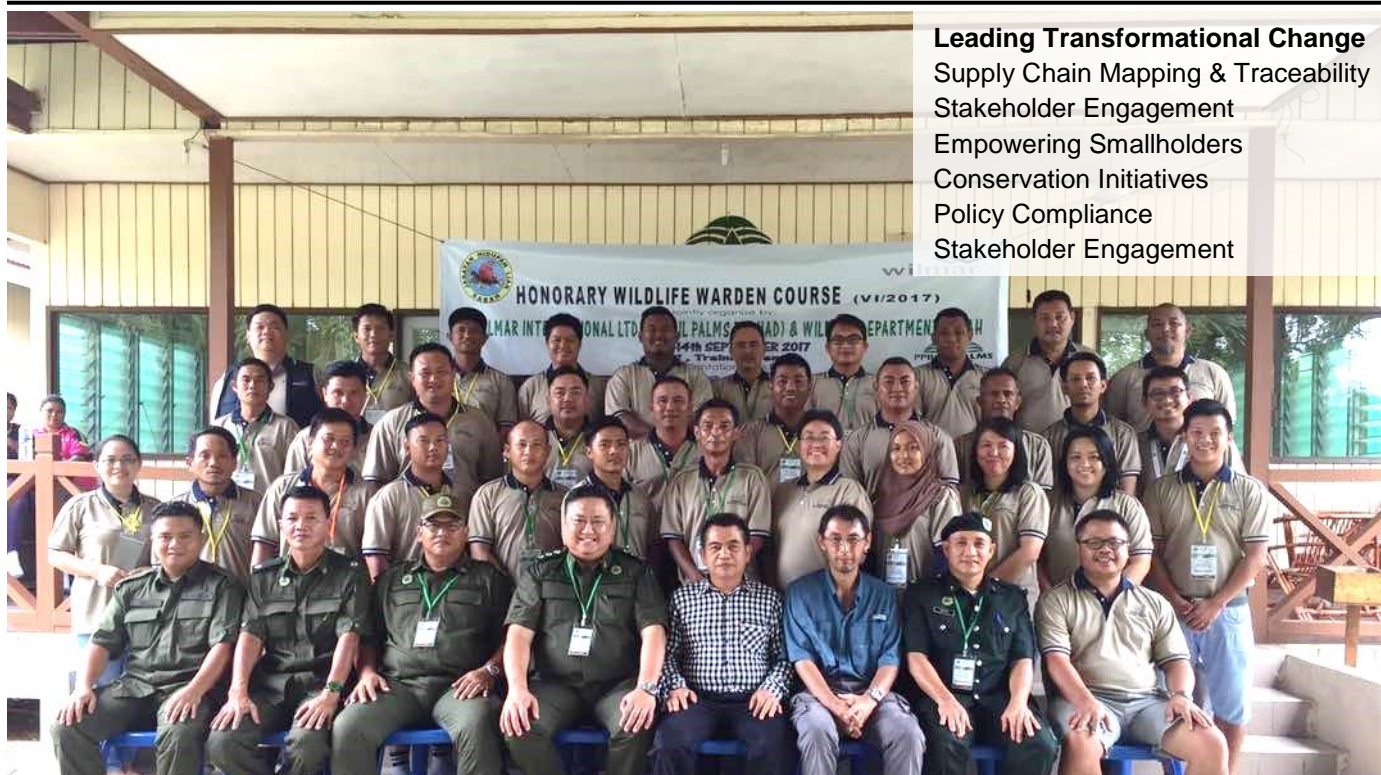
Wilmar's Honorary Wildlife Wardens in Sabah