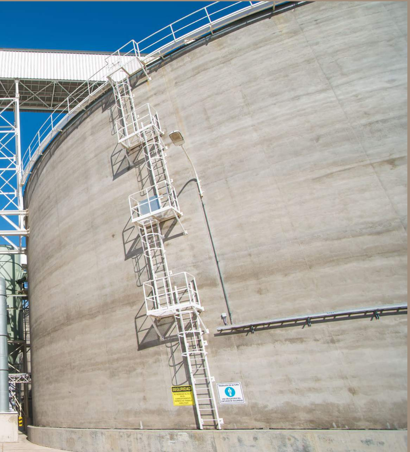
Bahía Blanca, Argentina