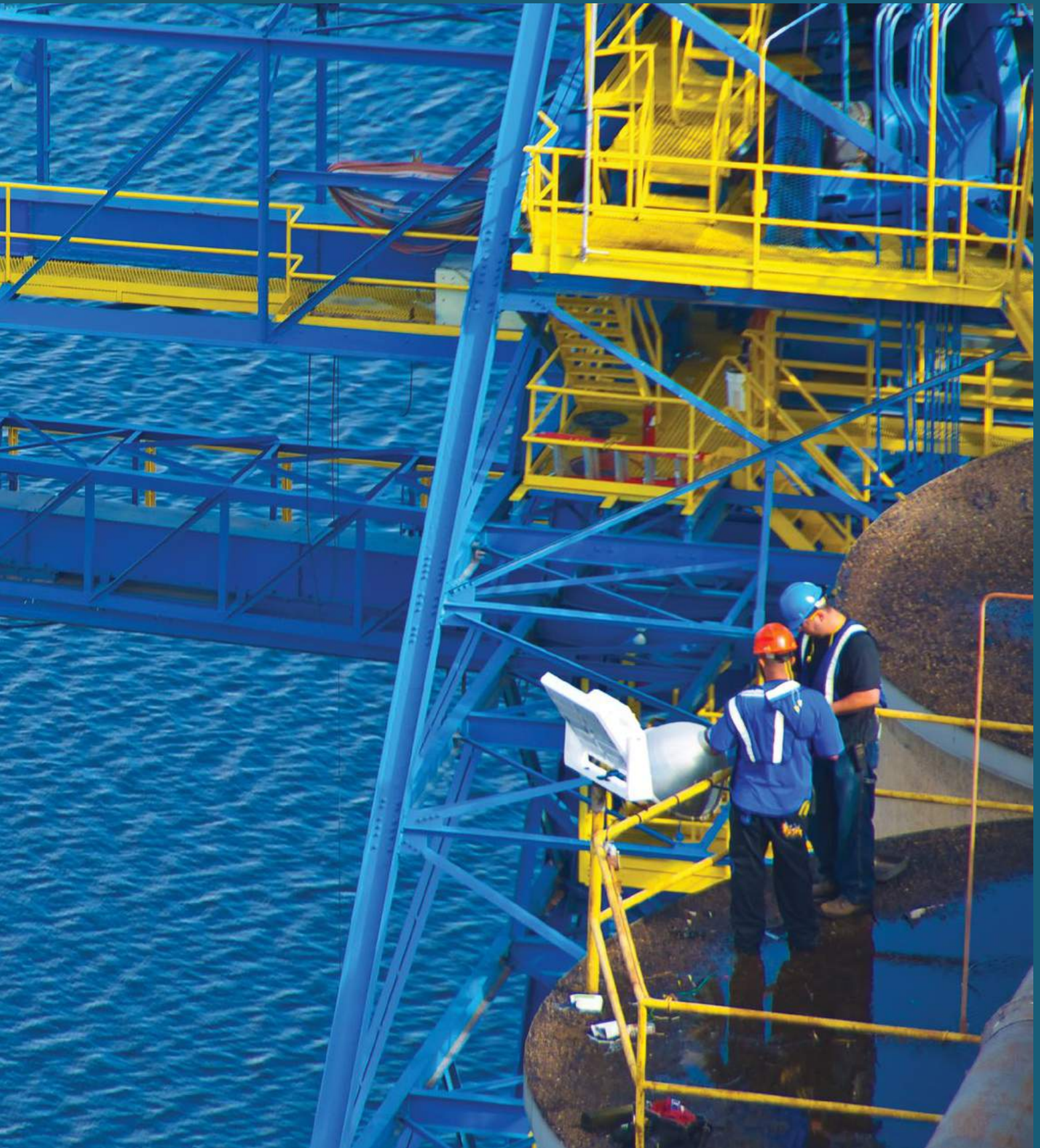
Beaumont, TX, US