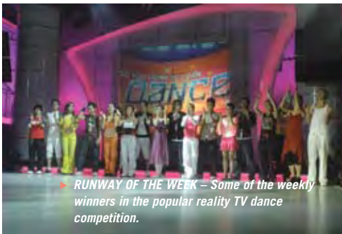
▶ RUNWAY OF THE WEEK – Some of the weekly winners in the popular reality TV dance competition.

Poh Kong Holdings Berhad (PKHB) held its 4th Annual General Meeting for shareholders at the Hilton Petaling Jaya.