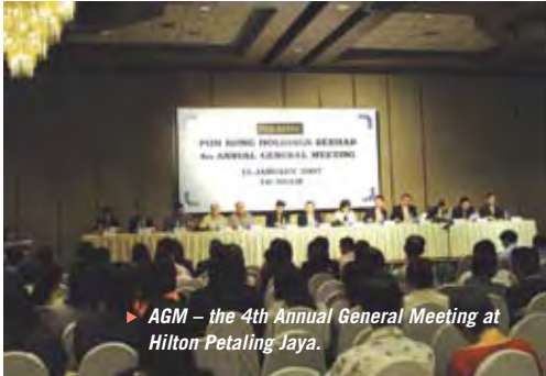
▶ AGM – the 4th Annual General Meeting at Hilton Petaling Jaya.