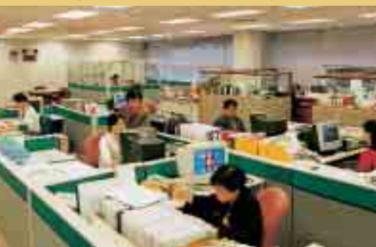
▲ Training Department, Training Centre, Bangi