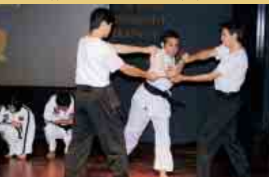
▲ Programme for Executive Development