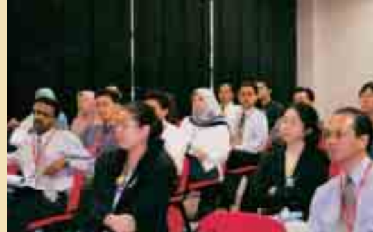
▲ Internal Training Course, Training Centre, Bangi

Training plays a key role in conveying the “quality” message. Through active partnership with the various business units, the training curriculum will integrate business strategies and action plans with the required skills set for organisational effectiveness. Staff are not only ingrained with the standards set for the work processes but are also updated with contemporary skills and knowledge through various training media. To be customer-centric focused, staff are inculcated with a sense of pride so that they will “Do It Right” for the customers, the shareholders and the community at all times. The Bank aims to distance itself from its competitors by making, “giving value-added service” an integral part of the way it conducts its business.