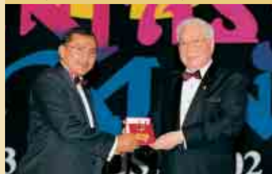
▲ Service Recognition Awards