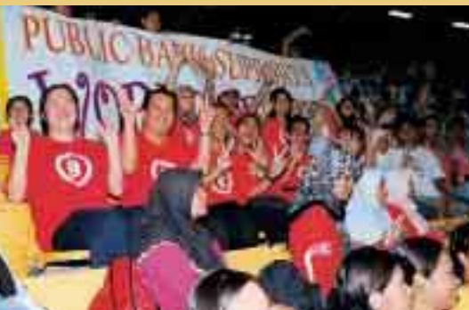
▲ Support for World Peace Campaign