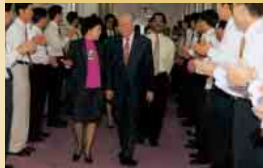
▲ Programme for Executive Development