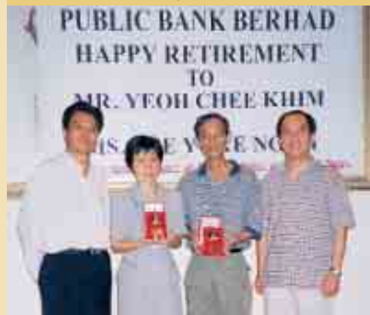
▲ Retirement Awards