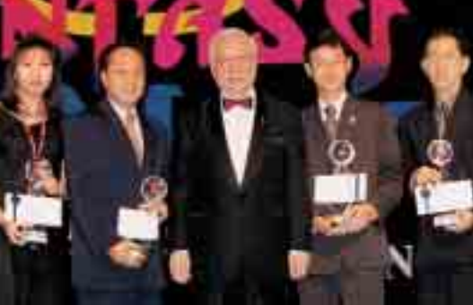
▲ Customer Care Campaign Award Winners