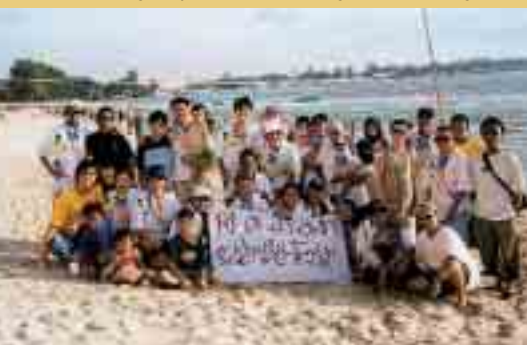
▲ Branch Family Day