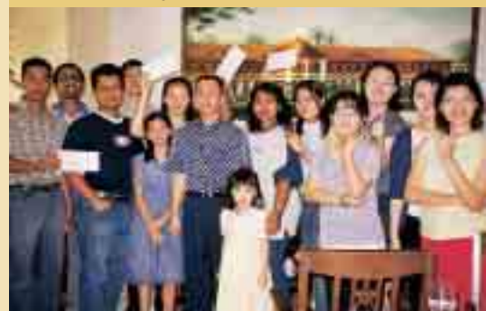
▲ Branch Staff Gathering