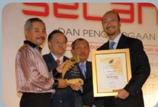
Photo taken during the Award Ceremony Dinner on 14 December 2007

We at OPCOM are committed to meet and exceed customer expectations through high-quality products, timely delivery and excellent customer service whilst maintaining a high level of environmental awareness through best environmental practices.