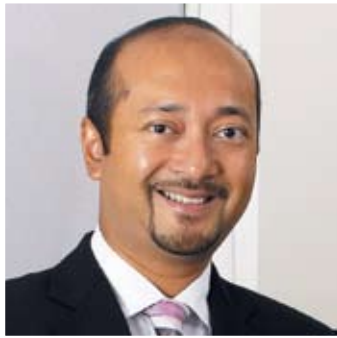
Dato' Mukhriz Mahathir Chairman / Managing Director