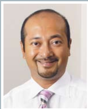
DATO' MUKHRIZ MAHATHIR Chairman/Managing Director