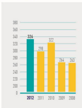
Revenue (RM Million)