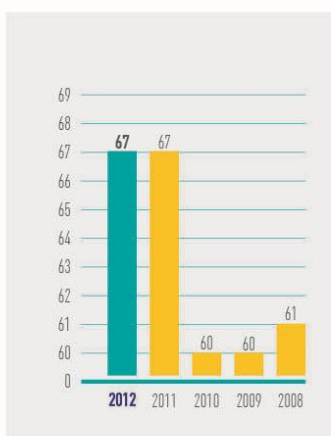
Fixed Assets (RM Million)