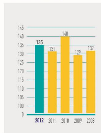
Net Current Assets (RM Million)