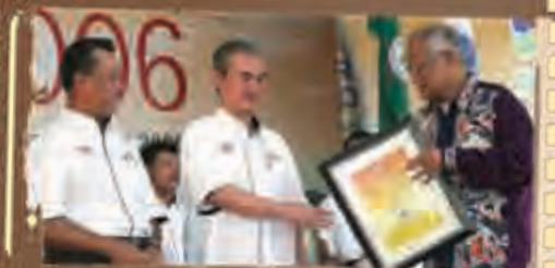
Special Award of Malaysia Agriculture, Horticulture & Agrotourism Show (“MAHA”)