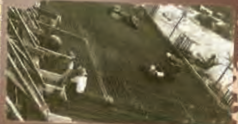
Layout of reinforcement for floor slab