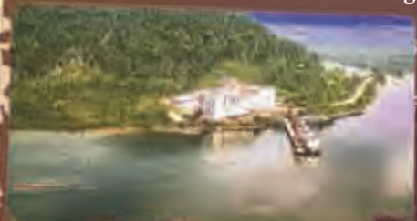
MFM flour mill at Lumut, Perak