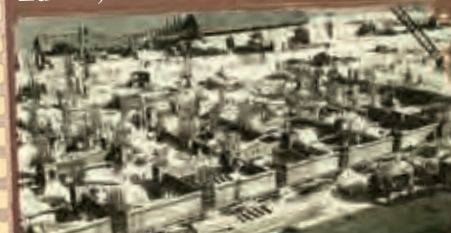
Ground beam of Lumut mill