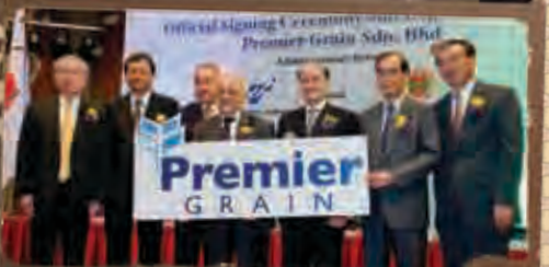
Opening ceremony of Premier Grain Sdn Bhd officiated by Deputy Minister of International Trade and Industry, Dato’ Jacob Dungau