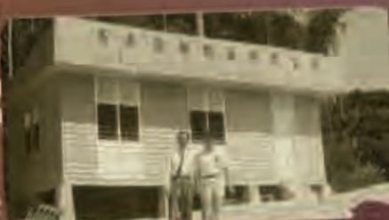
Temporary office nearby construction site