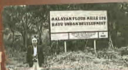
MFM early signboard