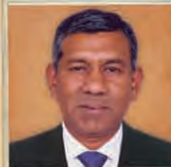
Dato' Wira Zainal Abidin bin Mahamad Zain