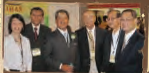
Participation in the Malaysia International Halal Showcase (“MIHAS”)