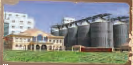
Flour mill at Baria-Vungtau Province, Southern Vietnam