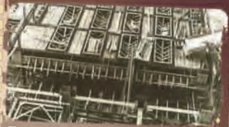
Form work and reinforcement for floor slab

As part of the Poultry Integration Project, Dindings Broiler Breeder Farm Sdn Bhd was established in 1988. It commenced its production of broiler day-old-chicks in 1990. The broiler breeder farm can produce about 1.9 million broiler day old-chicks monthly.