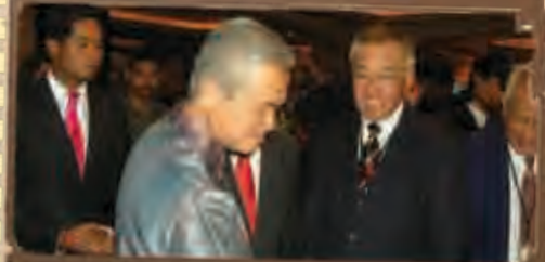
Participation in the World Halal Forum