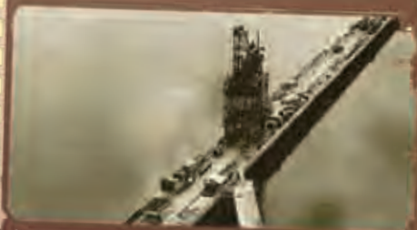
Construction of jetty in progress