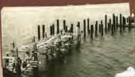
Piling for the jetty in Lumut