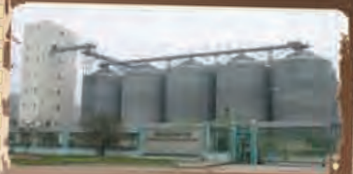
Flour mill at Cai Lan, Northern Vietnam

For its business to be sustainable and to add value to the stakeholders, MFM is continuing to grow its business by way of expanding its existing facilities in Malaysia and Vietnam as well as actively exploring investment opportunities in the ASEAN region.