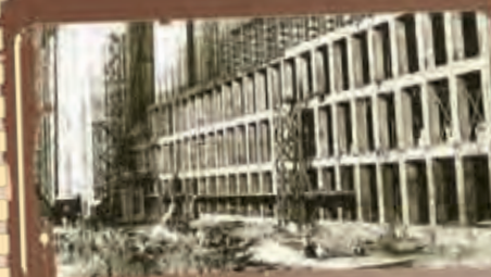
Construction of flour mill in progress