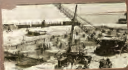
Early construction of flour mill in Lumut, Perak