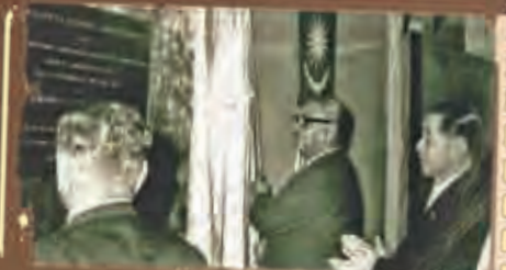
Opening ceremony of MFM in Lumut, officiated by the first Prime Minister of Malaysia, the late Tunku Abdul Rahman