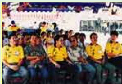
The beneficiaries and invited guest attending Khind Charity Warehouse Sales held on 5/8/99 to 8/8/99 which Khind donated RM 120,000 in cash and in kind.