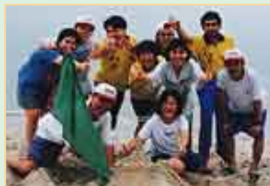
Annual Trip to Cherating, Pahang from 29/8/99 to 31/8/99.