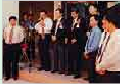
New branches and offices, a better place to serve our customers.