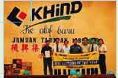
Presentation of the 10 Best Suppliers Awards at 99/00 Annual lunch held at Sekinchan on 29/1/00.