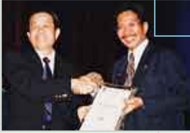
Khind's products are quality assured and complies to SIRIM standards.