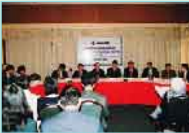
A view at the meeting room and registration counter of 3rd AGM/1st EGM held at Sunway Lagoon Resort Hotel, Bandar Sunway on 18/5/99.