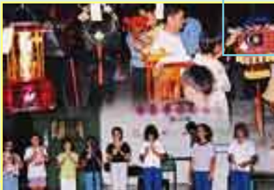
Khind organised Pesta Tanglung 1999 held on 23rd Sept '99.