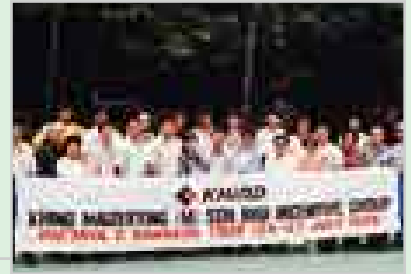
Incentive trip to reward Khind's loyal dealers.