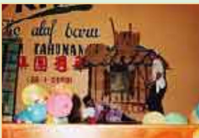
A fantastic performance by EAP Subcont department, KHI at the 99/00 Annual Lunch.