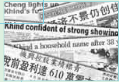
Khind's impressive financial performance and expansion received wide media coverage.