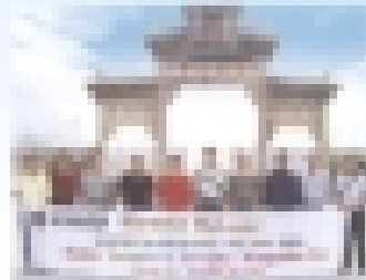
Zhaoqing - Wangyudao trip