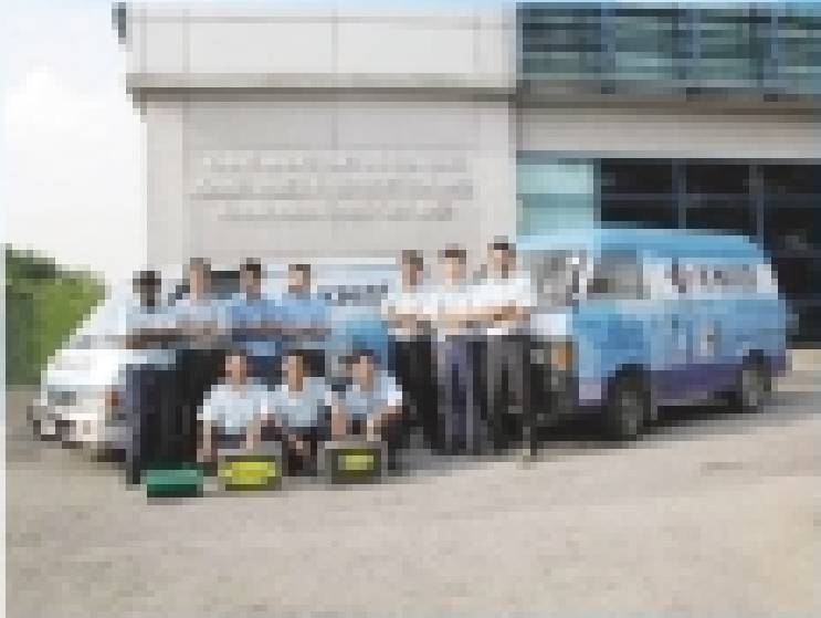
Khind Customer Service Team