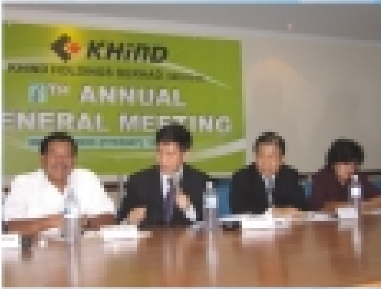
2003 Annual General Meeting