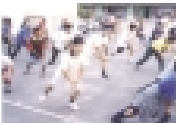
Outdoor activity organised by Kelab Sukan Kumpulan Khind