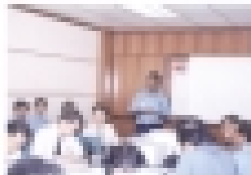
Khind Total Management System training for employees