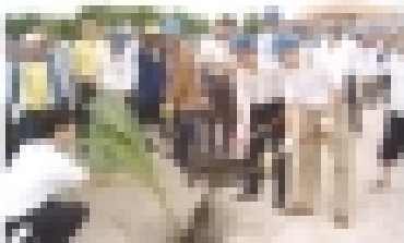
Bagan Lalang beach community service