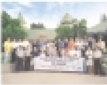
Bangkok - Pattaya trip