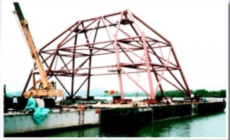
Load-out of Kangaroo Crane onto two barges at Plant No.3, Lumut for TNB Janamanjung project