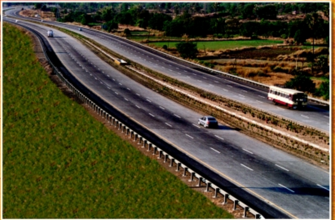
Mumbai-Pune Expressway, India