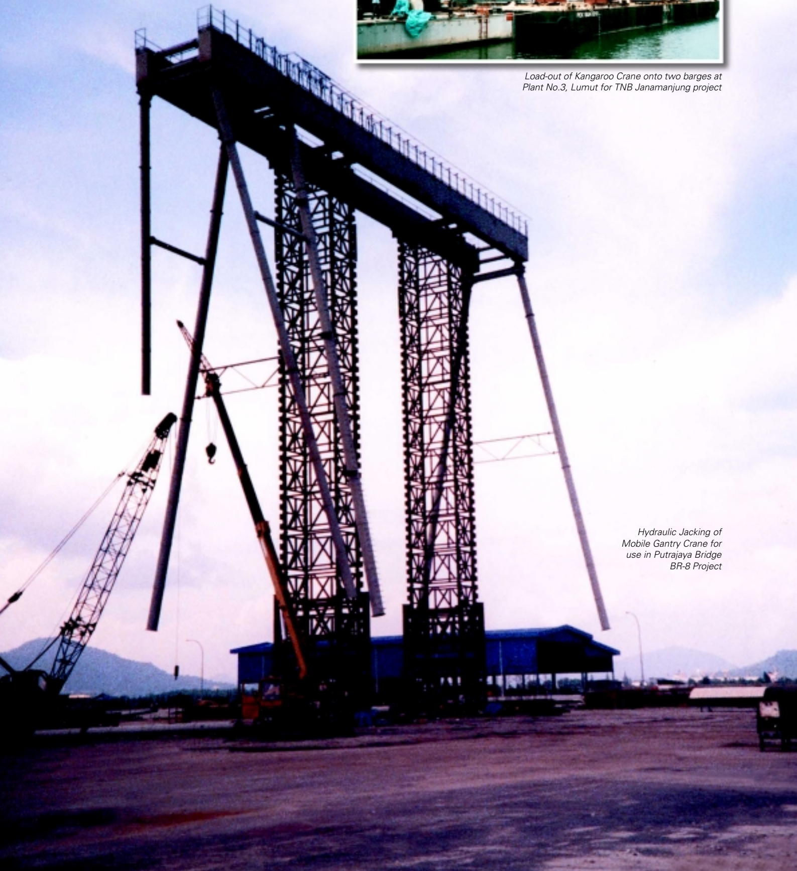
Hydraulic Jacking of Mobile Gantry Crane for use in Putrajaya Bridge BR-8 Project