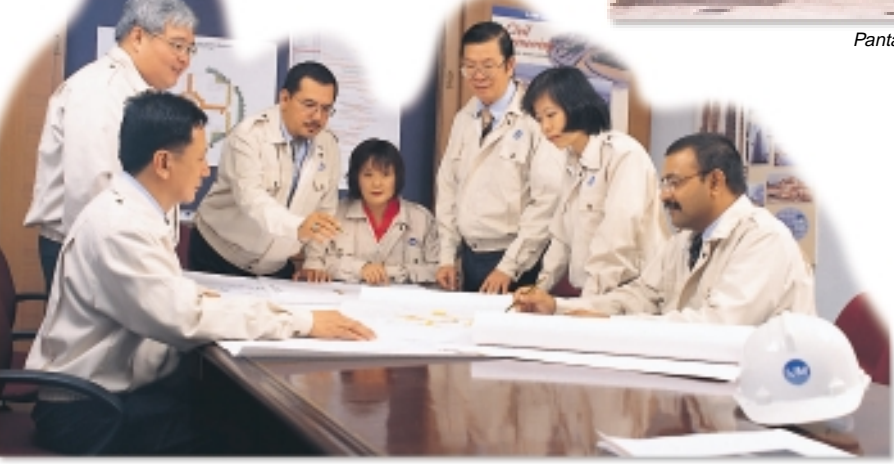
Construction Support Services