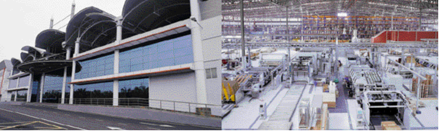
The new Central box plant at GSIP Mill Complex in Kuala Langat, Selangor