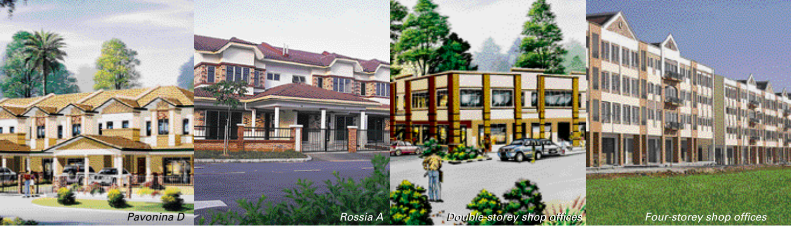
Residential and commercial developments in Indahpura