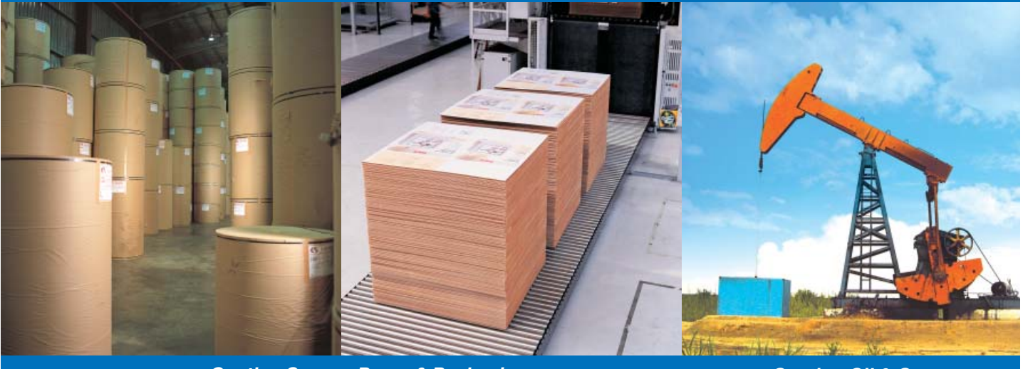
Genting Sanyen Paper & Packaging Malaysia's largest integrated recycled paper and packaging manufacturer