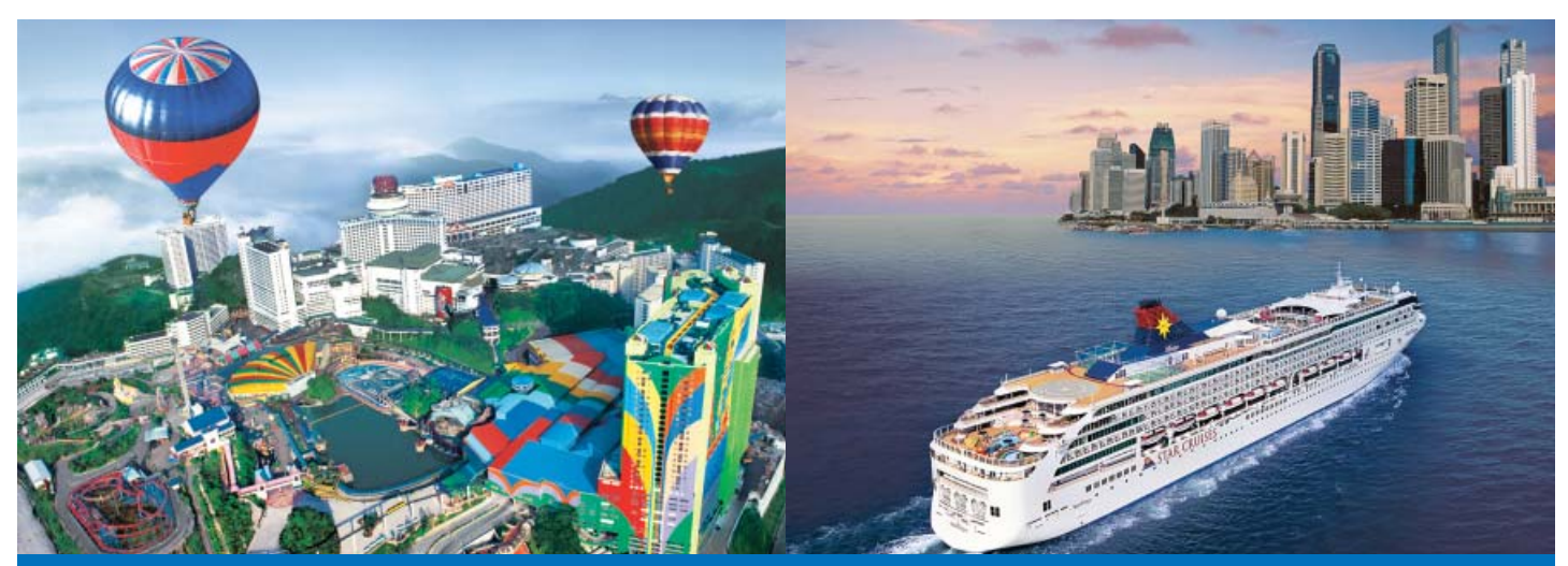
Resorts World One of the world's leading leisure and hospitality corporations