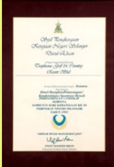
Tropicana Golf and Country Resort Award for Best Landscape, Hotel/Complex/ Condominium/Luxury Apartments Category, 1997 by Selangor State Government