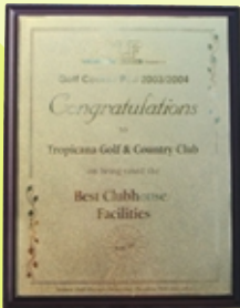
Tropicana Golf & Country Resort Award for Best Clubhouse/Facilities by Golf Malaysia's Readers' Poll • 2001/2002 • 2003/2004