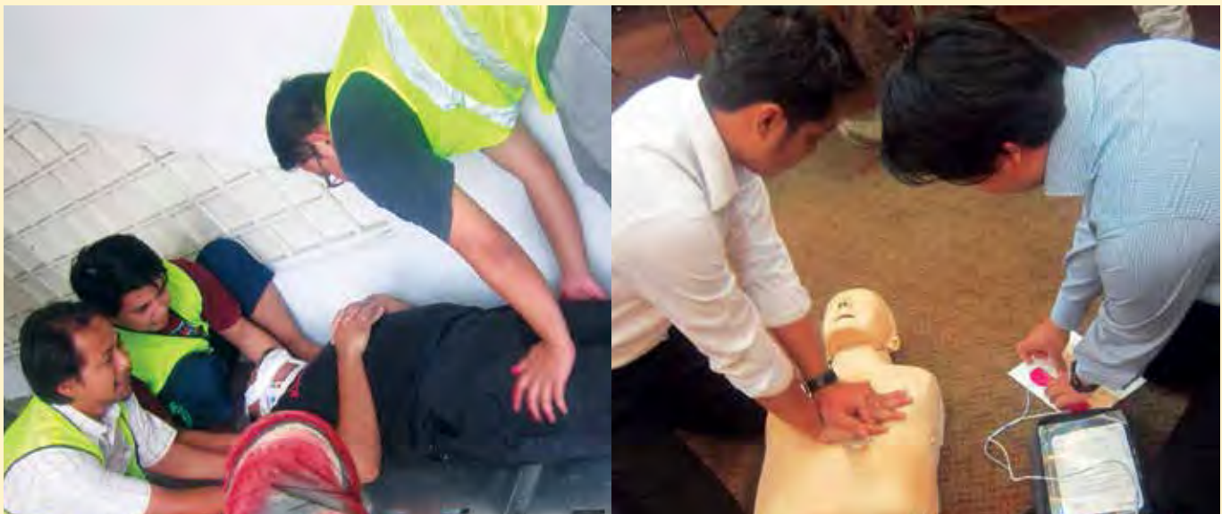
Basic occupational first-aid training

The Deleum Group held its annual HSE Campaign via a 'HSE Week' programme to emphasise on safety, health and environmental awareness. In 2013, the Group adopted the theme of 'Healthy Lifestyle' and held the 'Deleum's Biggest Loser' programme which aimed to promote and encourage employees wellbeing and a better quality of life. Likewise, other complementing health programmes such as health screenings, health talks, and medical checkups were held to educate employees on the importance of self-sustainability. Besides safety in the workplace, the 'HSE Week' focused on other safety practices regarding housekeeping and prevention of snatch theft and robbery. Furthermore, the Deleum Group partnered with Pusat Darah Negara to organise a blood donation drive during the 'HSE Week' , as part of our commitment to serve the community.