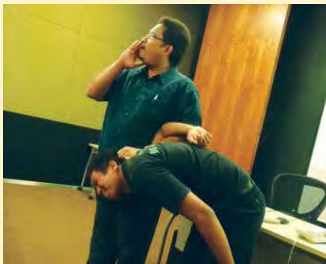
Talk on personal safety