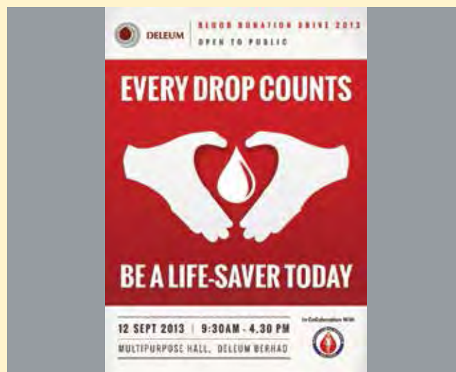
Blood donation drive