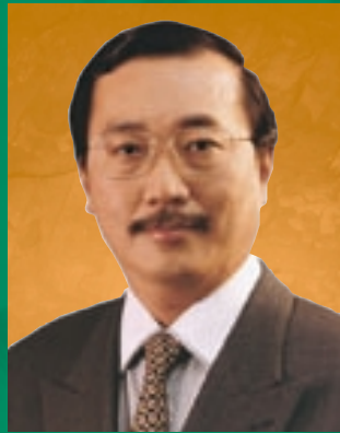
TAN SRI DATO' SERI VINCENT TAN CHEE YIOUN Chief Executive Officer