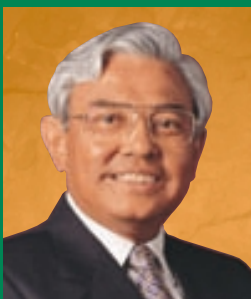
DATO' MOHAMMED ADNAN BIN SHUAIB