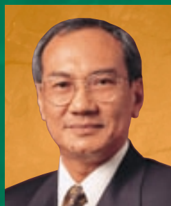
DATO' ZAKI BIN AZMI