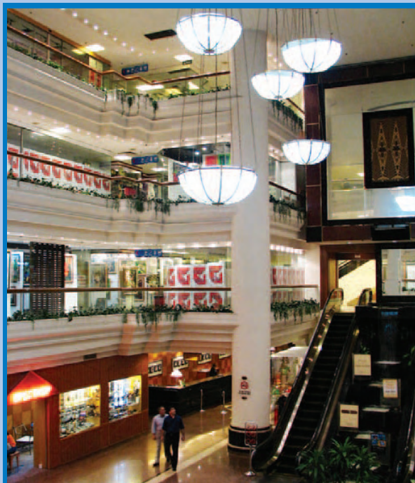
Interior of City Square Shopping Centre