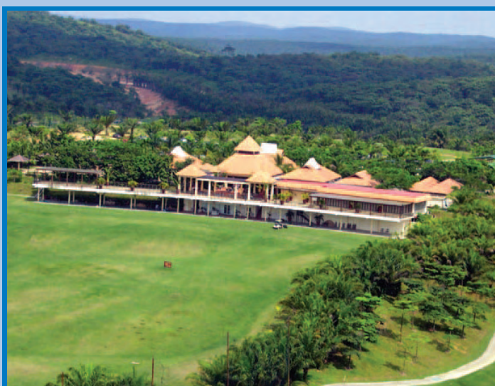
Tasik Puteri Golf & Country Club with its resort styled clubhouse.

The clubhouse features a 24-bay driving range, a golfers' terrace, changing rooms, bar, a multi-purpose room, a pro-shop and a swimming/wading pool. A restaurant serving local delicacies, Chinese and Japanese cuisine and light snacks ideal for corporate and family enjoyment, is also available. The club is currently being expanded to become a 27-hole course with additional club facilities to be provided for patrons in the future.