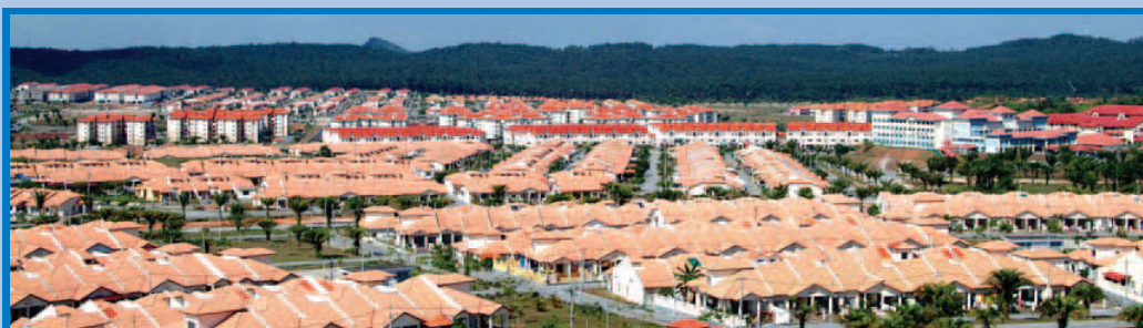
Bandar Tasik Puteri, an Urban Regional Centre (URC), in the Mukim of Rawang, Selangor