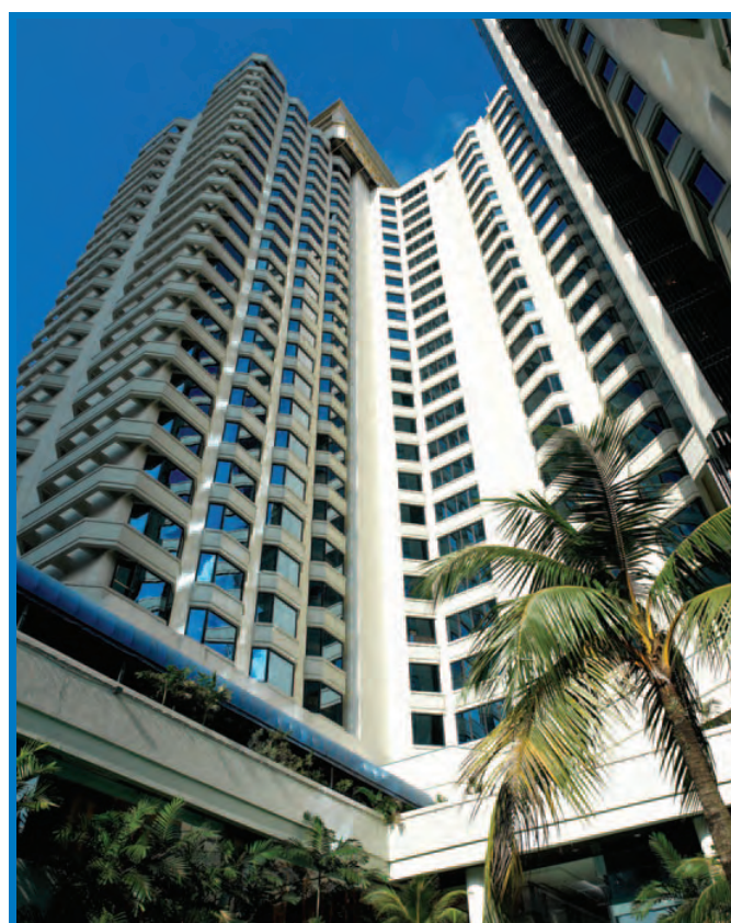
The Crown Princess Kuala Lumpur strategically located within the prestigious embassy belt of Kuala Lumpur.