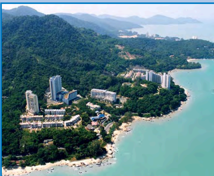
Aerial view of Mount Pleasure Resort, Penang

To-date, 600 units of these mixed residential development have already been built and occupied. Residents in the township enjoy the benefits of a hill environment and panoramic sea views in addition to a range of recreation, sporting and entertainment facilities located within the township and the adjacent Ferringhi Beach Hotel Penang.