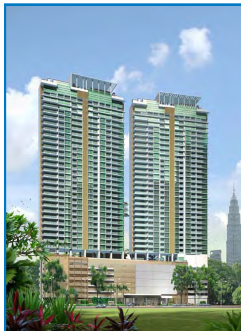
Artist's impression of [myHabitat] serviced residences