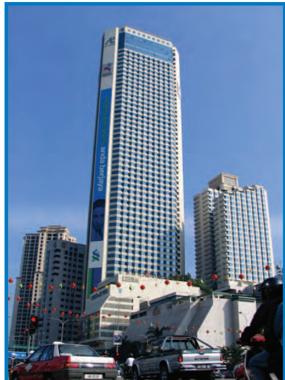
The Integrated City Square Centre comprising • Empire Tower • City Square Shopping Centre • Crown Princess Kuala Lumpur