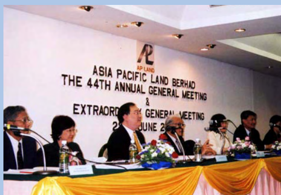
The 44th Annual General Meeting of AP Land held on 28 June 2005.